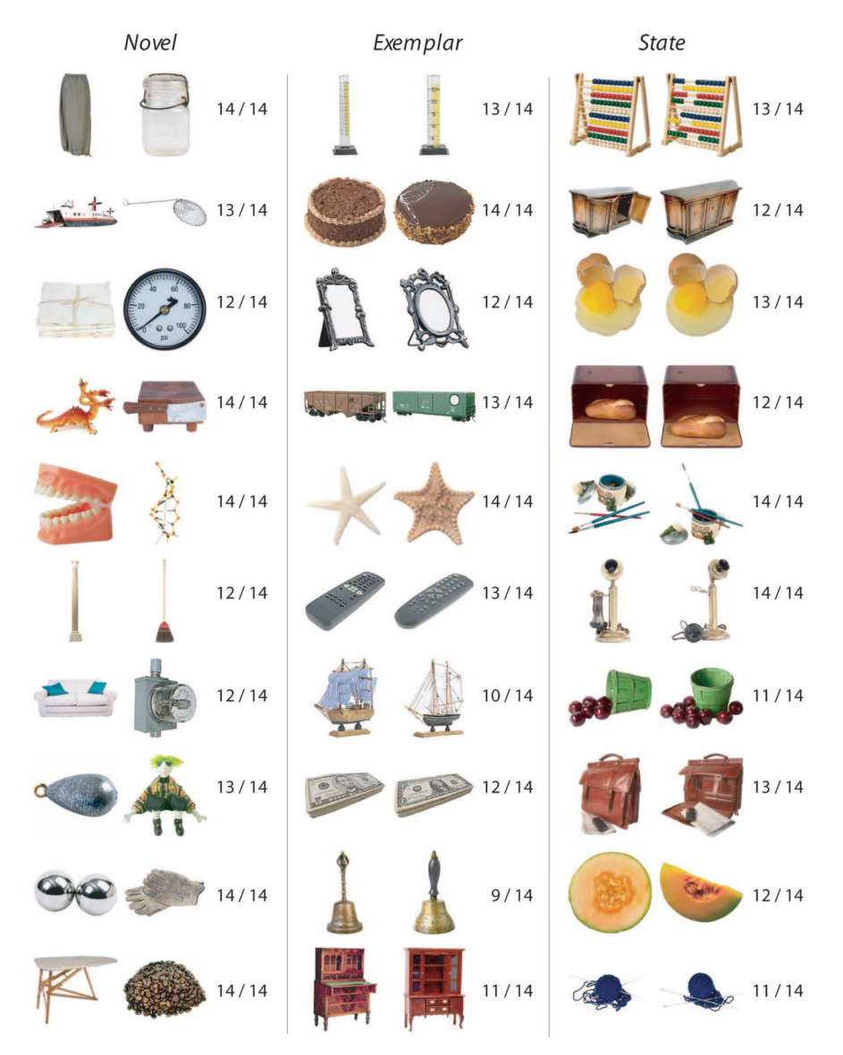
Fig. 1. Example test pairs presented during the two-alternative forced-choice task for all three conditions (novel, exemplar, and state). The number of observers reporting the correct item is shown for each of the depicted pairs. The experimental stimuli are available from the authors.

sand objects. Combined, these manipulations enable us to estimate a new bound on the capacity of memory to store visual information.